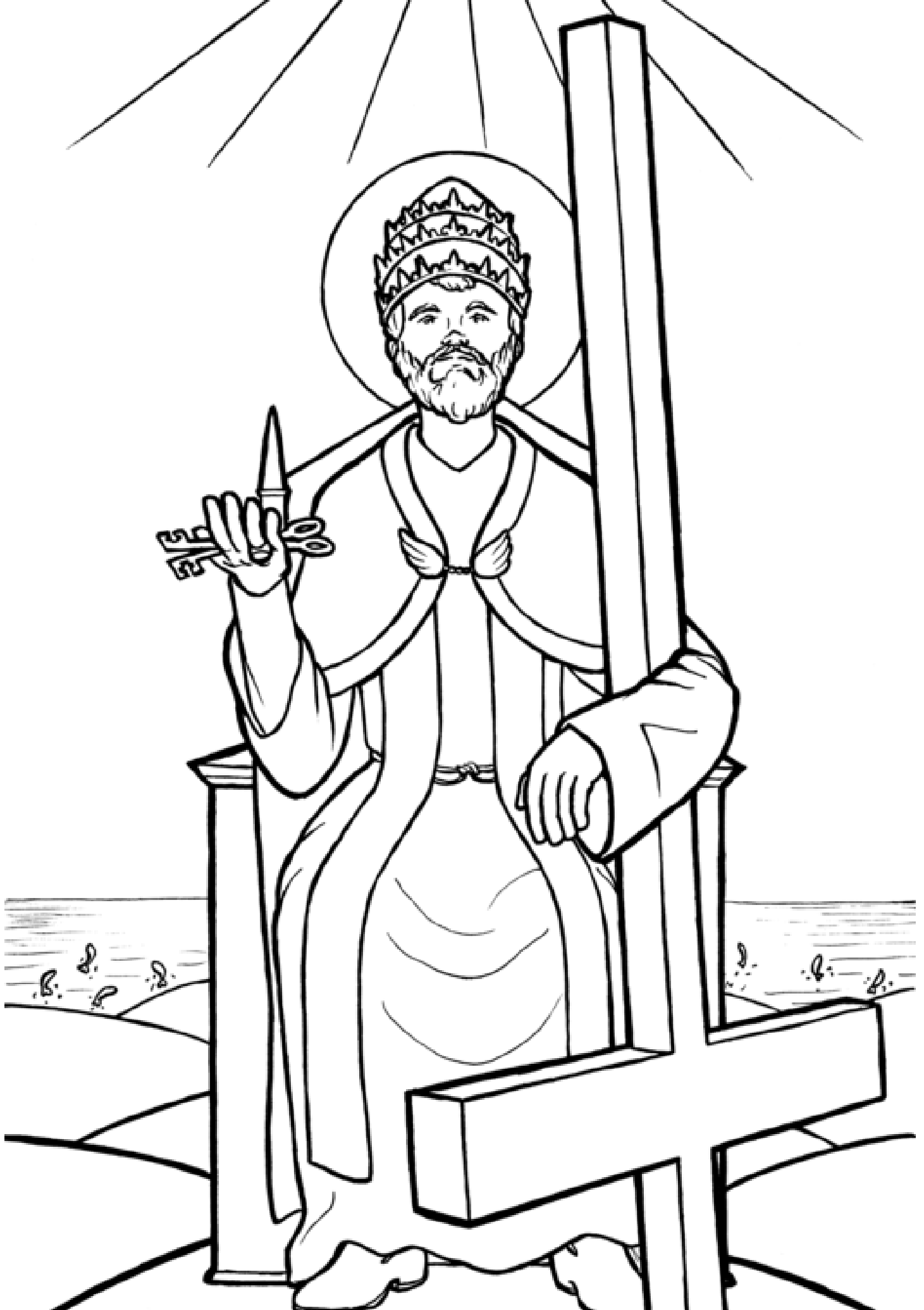
from the Liturgical Calendar Coloring Book--see blog for info